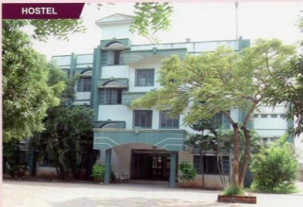
A HOME AWAY FROM HOME

TACW Hostel is established with the motto of providing safe and secure stay for the outstation students. It has 44 rooms accommodating 300 students and 13 faculty members. The following facilities are available in the hostel to create homely environment for the inmates.