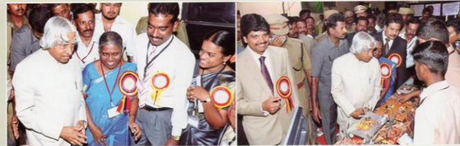
Lead Villupuram 2020 - His Excellency Former President Dr A.P.J Abdul Kalam