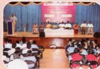
DST Sponsored Inspire Programme