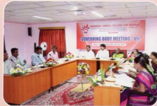
Governing Body Meeting