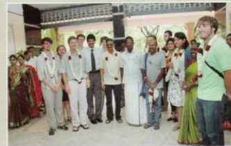
Visit of students and faculty from Davidson college, North Carolina, USA