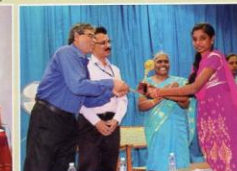
Indian Bank Essay Writing competition Prize Winner