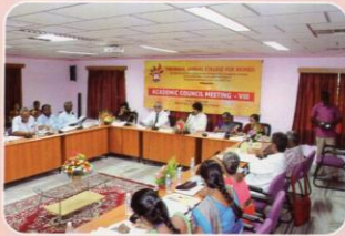
Academic Council Meet