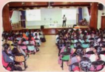
Overseas study Programme