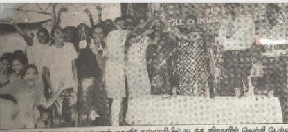
விழுப்புரம் தெய்வானை அம்மாள் கல்லூரியில் நடந்த விழாவில் வெற்றி பெற்ற மாணவர்களுக்கு கழநி சேவைப் பதக்கம் வழங்கப்பட்டது.

தெய்வானை அம்மாள் கல்லூரியில் மாணவர் பேரவை தொடக்க விழா விழுப்புரம், ஜூலை 24: விழுப்புரம் தெய்வானை அம்மாள் கல்லூரியில் மாணவர் பேரவை தொடக்க விழா நடைபெற்றது. மாணவர் பேரவை தலைவர் தலைமையில் விழா நடைபெற்றது. மாணவர் பேரவை தலைவர் தலைமையில் விழா நடைபெற்றது. மாணவர் பேரவை தலைவர் தலைமையில் விழா நடைபெற்றது.