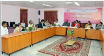
Interaction with CDC