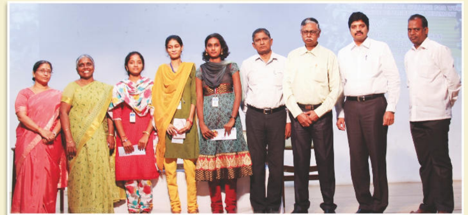
Indian Bank Essay Writing Competition Prize Winners