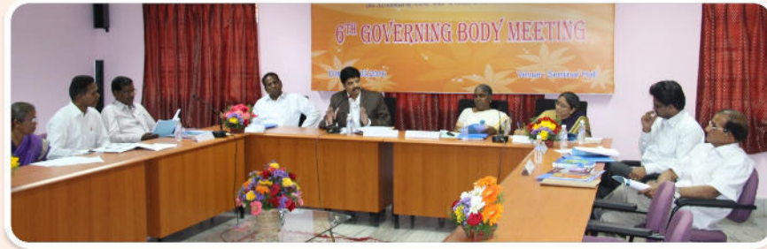
6th Governing Body Meeting