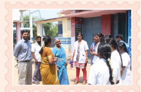
Cancer Screening Test - Kozapalayam Village