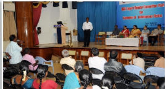
Interaction with Parent