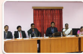
ISO EXTERNAL AUDIT