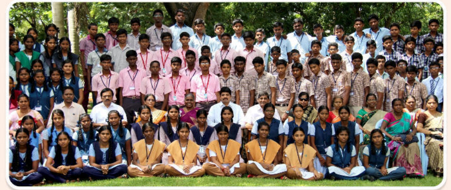
DST SPONSORED INSPIRE INTERNSHIP CAMP