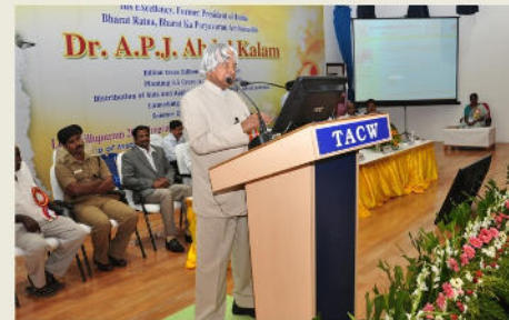
Lead Villupuram 2020 - His Excellency Former President Dr. A.P.J. Abdul Kalam