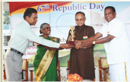
67 th Republic Day Celebration: Chief Guest: Tamil Mamani Prabanchan, Renowned Writer