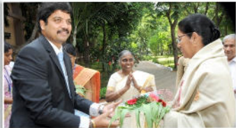
Arrival at TACW