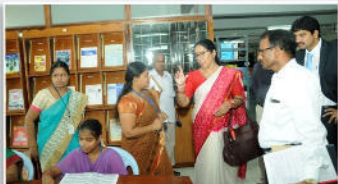
Visit to Library