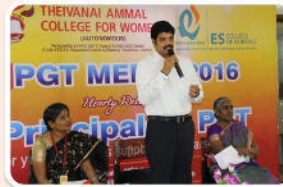
PGT Meet - 2016