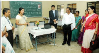
Visit to the Department