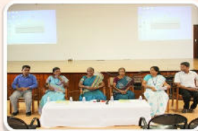
National Science Day Celebration