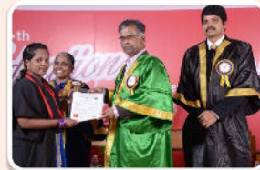
15th Graduation day