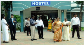
Visit to Hostel